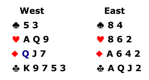
Dealer: North; both sides vulnerable

As West you open 1NT after three passes (perhaps thinking it might be best to pass the hand in!)